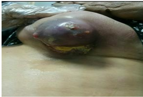
Figure 1; cutaneous metastasis of breast carcinoma in a 56-year-old woman

The histological examination revealed that the tumor was composed of sheets of malignant cells and many necrotic areas. The neoplastic cells have large pleomorphic vesicular nuclei some with prominent nucleoli and mitotic figure. The diagnosis was invasive ductal breast carcinoma, cutaneous metastases and lymphatic embolization (Figure 2). Then the patient underwent a computed tomography scan. Computed tomography revealed a sizeable contrast-enhanced tumor in the left breast and infiltration of the left lung.